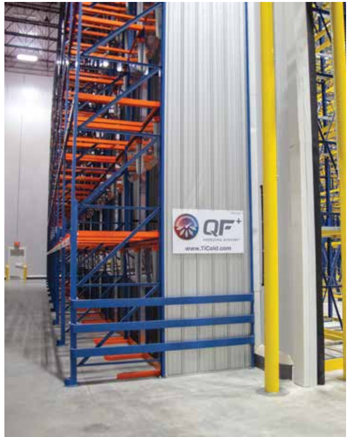
(L to R) The new Wolverine Packing Company processing and distribution center has 20,000 pallet positions of storage space. (Photo courtesy of Tippmann Innovation.) The QF+ blast freezer provides a rapid, even freeze of products while producing less waste and requiring less energy. (Photo courtesy of Tippmann Innovation.)